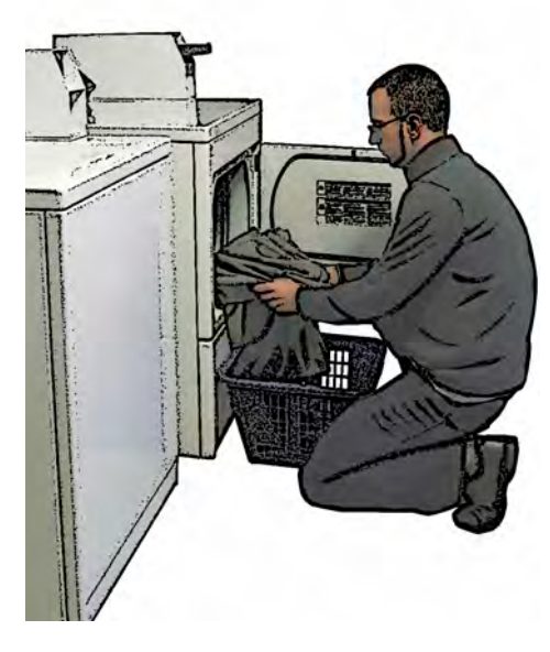
Fold laundry at home.