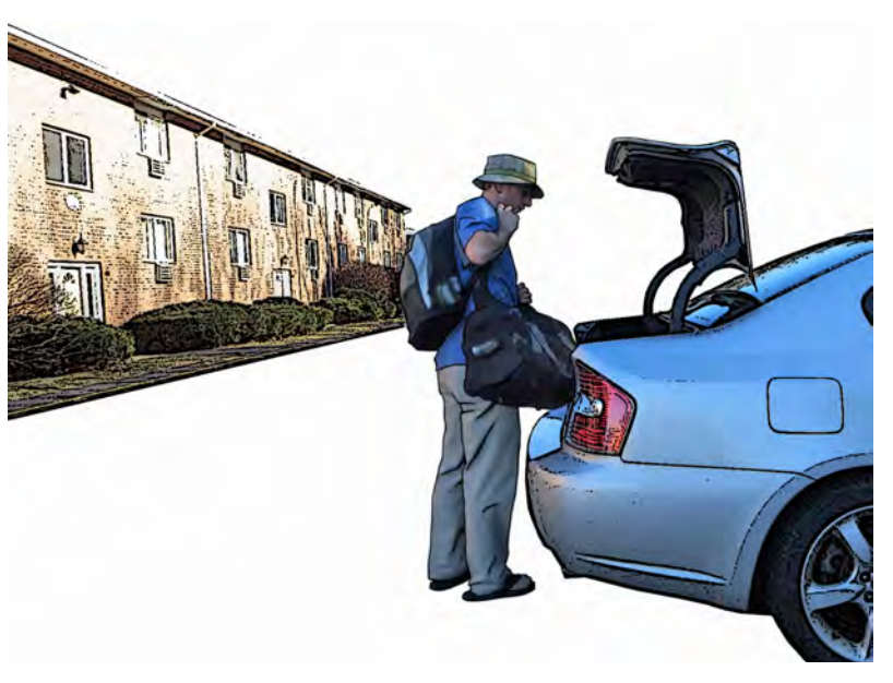
Bed bugs from one resident's travel can spread to neighbors.

Pests travel between shared walls and use utility lines in multifamily buildings.