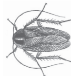
German cockroach adult

Minimize the use of pesticides that pollute our waterways. Use nonchemical alternatives or less toxic pesticide products whenever possible. Read product labels carefully and follow instructions on proper use, storage, and disposal.