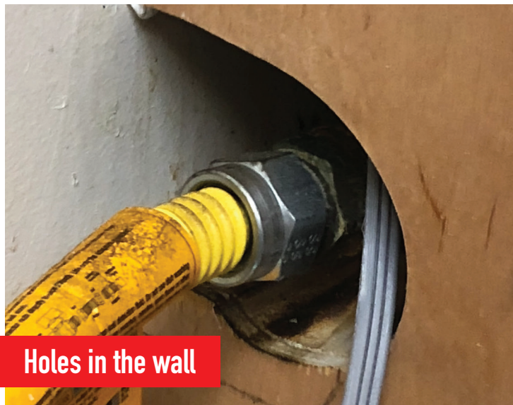
Holes in the wall