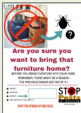
Bed bugs often spread when residents pick up discarded furniture. StopPests produced a poster template for sites to discourage this practice.