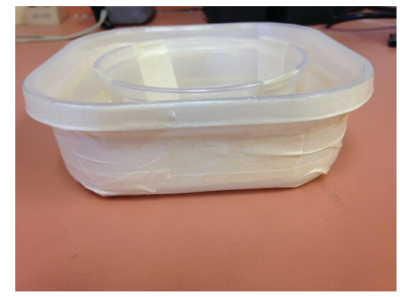
Figure 5. The rough-surfaced tape has been tightly wrapped around the large container. It is important that the tape is wrapped tightly and that no cracks or crevices are created where bed bugs can hide.

4. Glue the smaller container onto the center of the bottom of the larger container.