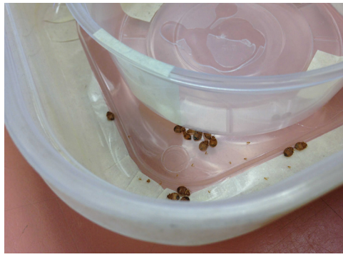
Figure 12. Bed bug interceptor trap with victims.