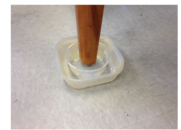
Figure 10. Interceptor trap placed under the leg of a piece of furniture.

6. Move the piece of furniture to be protected away from walls and other furniture, and place a trap underneath each of its legs. With beds, bedding should not be touching the floor, walls, or other furniture.