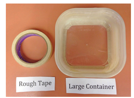
Figure 4. Rough-surfaced tape and a large container are needed for step #3.

3. Wrap the rough-surfaced tape around the exterior side of the larger container so that the entire outer surface is covered from the base to the upper edge of the container.