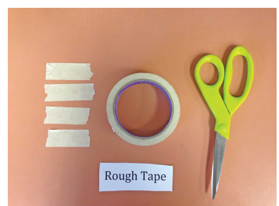
Figure 2. Four pieces of rough-surfaced tape cut to match the height of the wall of the small container.

1. Cut four pieces of rough-surfaced tape. The cut pieces should be at least as high as the wall of the smaller container.