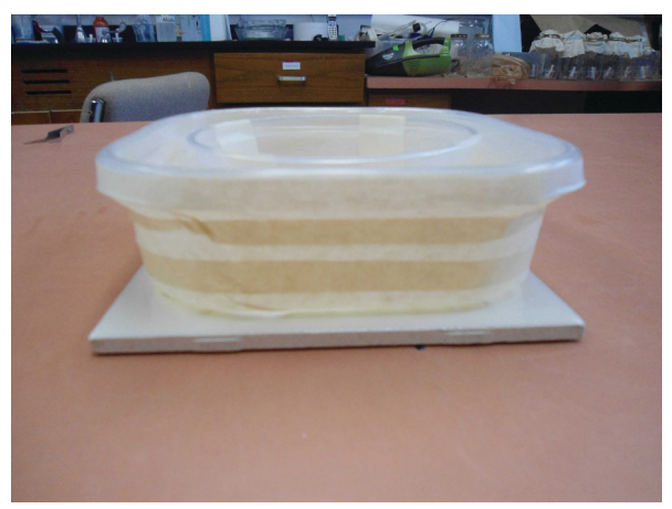
Figure 11. Square of tile placed underneath an interceptor trap.

Option : On carpeted floor, place a square of tile or plywood underneath the trap to prevent the trap from breaking under the weight of the furniture.