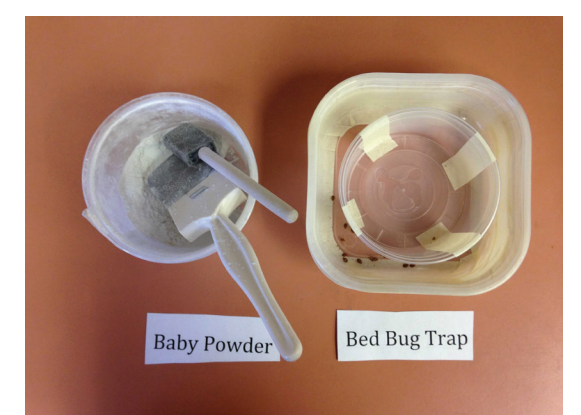
Figure 8. Use a sponge or a brush to dust the trap with powder.