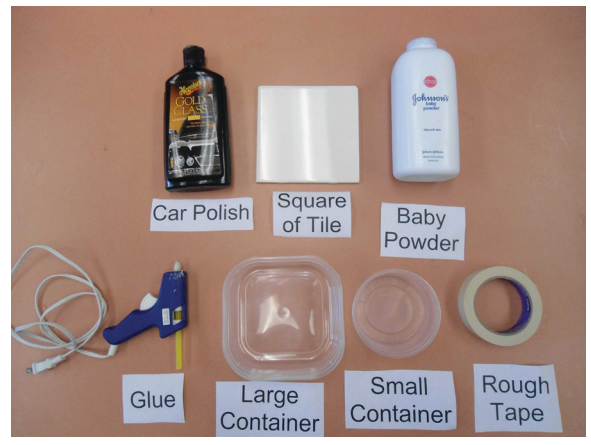
Figure 1. Items needed to make a single bed bug interceptor trap. From left to right and top to bottom: Car polish, square tile, baby powder, glue, large container, small container, rough-surfaced tape.