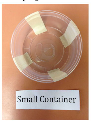
Figure 3. Rough-surfaced tape placed into the small container.

2. Evenly space and firmly press the four pieces of tape vertically on the inside surface of the smaller container to connect the inner top edge with the container bottom.