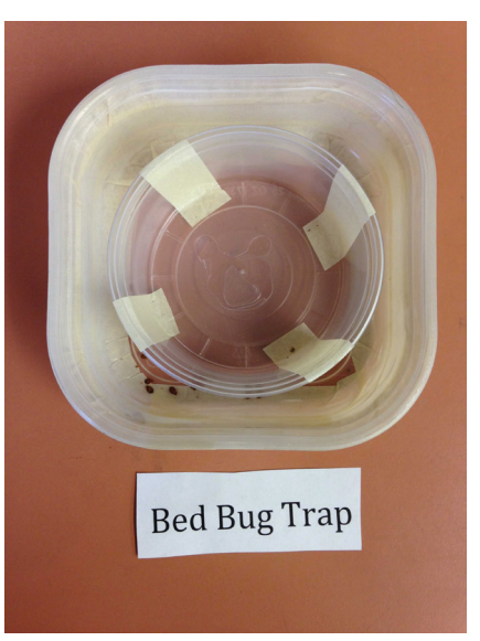
Figure 6. The small container has been glued inside the center of the large container. The walls of the containers should not touch.

4. Glue the smaller container onto the center of the bottom of the larger container.