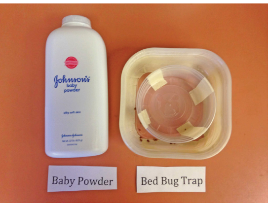
Figure 7. Baby powder and finished bed bug trap.

Option : Apply car polish or talcum powder to the interior side of the larger and exterior side of the smaller container. Follow the directions on the car polish bottle on how to apply and buff the product. If using talcum powder, do not touch the dusted trap surface with your hands. Talcum powder should be reapplied as necessary.